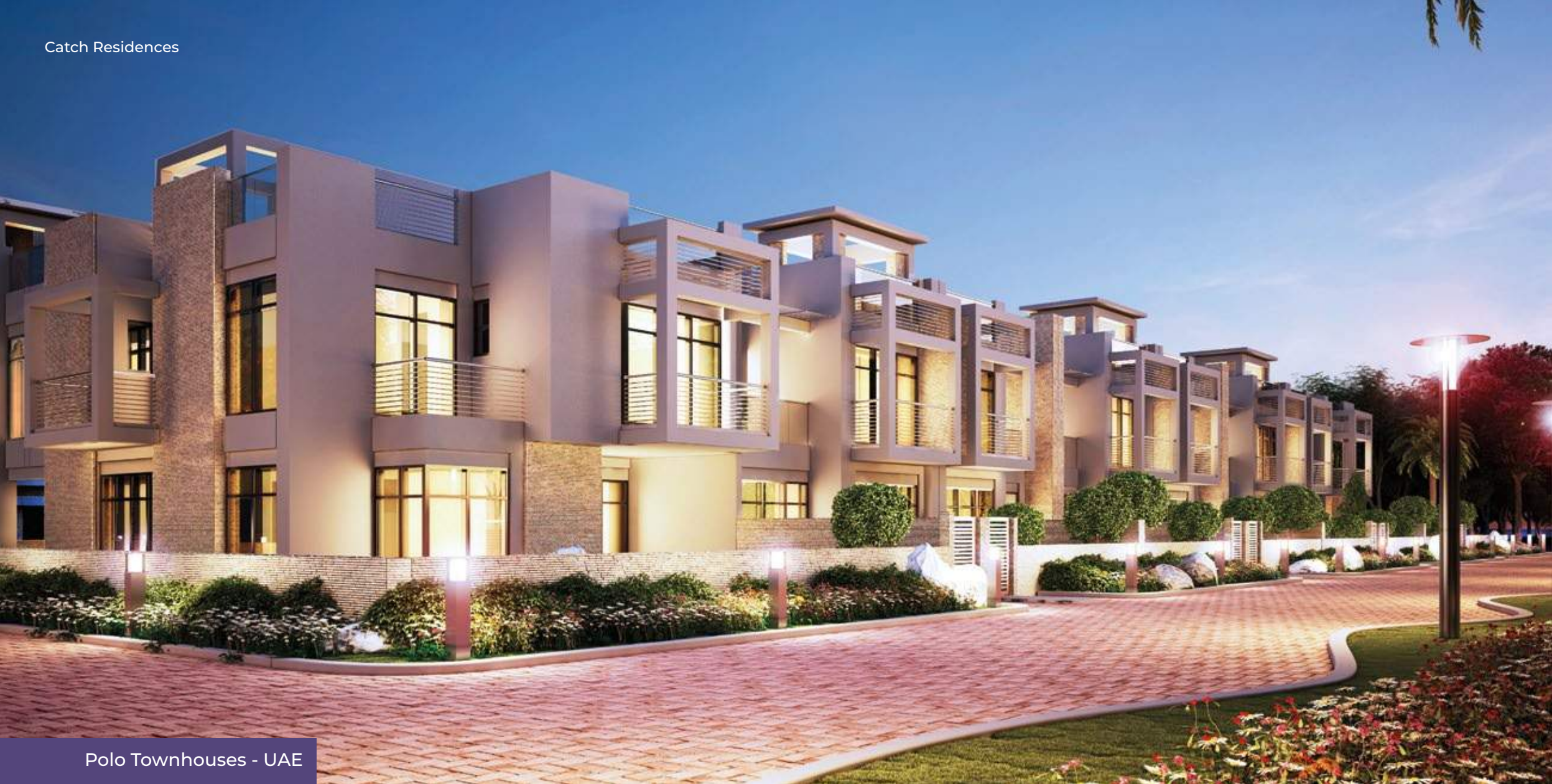
Polo Townhouses - UAE