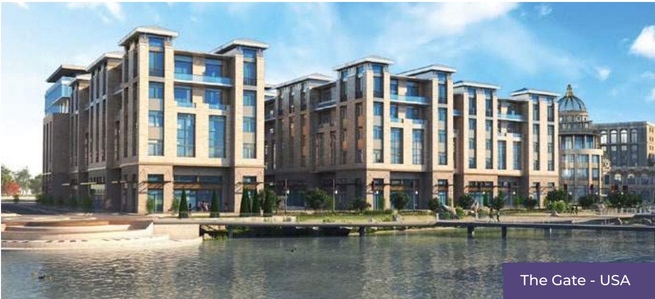
The Gate - USA

Today, an expanded and impressive portfolio of premium properties, which includes some of the most sought-after properties by meticulous clients worldwide, serve as a testament to IGO's well-deserved reputation as one of the top regional investment companies.