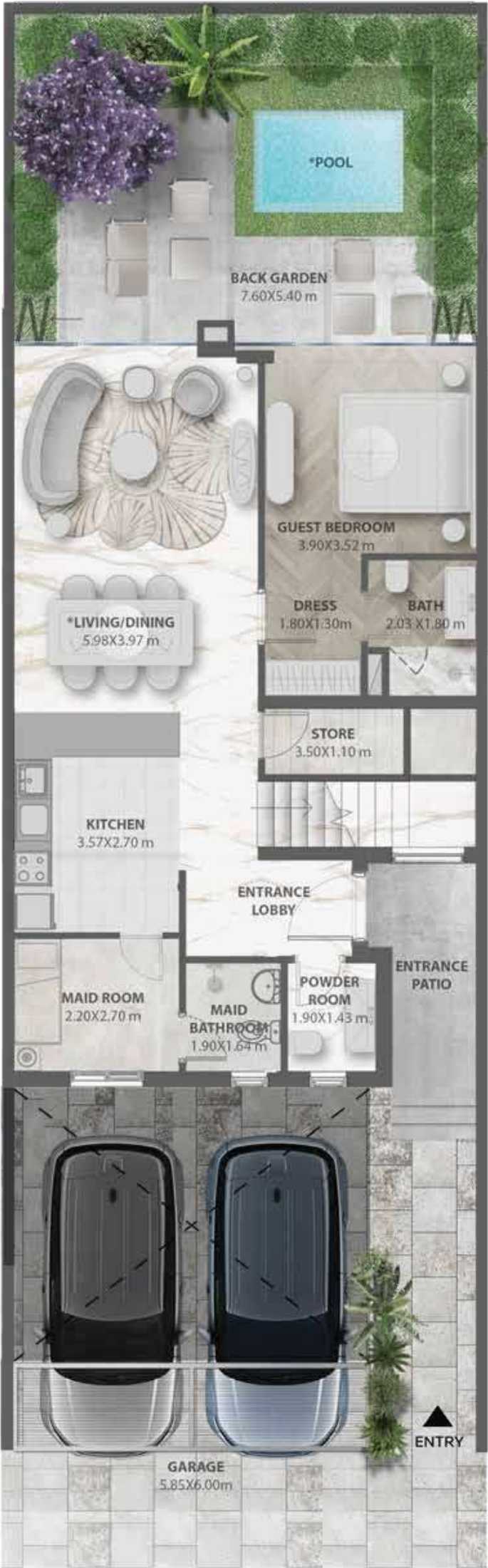
GRANDE UNIT GROUND FLOOR PLAN