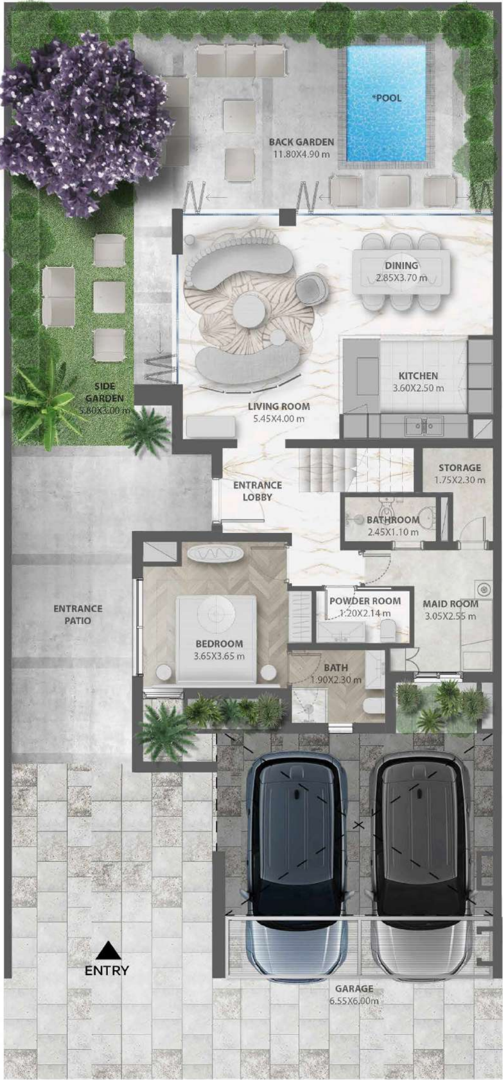
GRANDE PLUS UNIT GROUND FLOOR PLAN