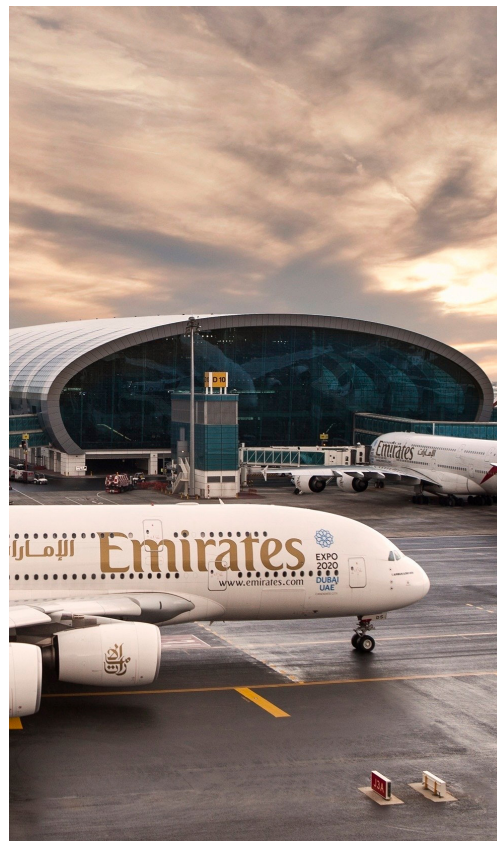
DUBAI INTERNATIONAL AIRPORT