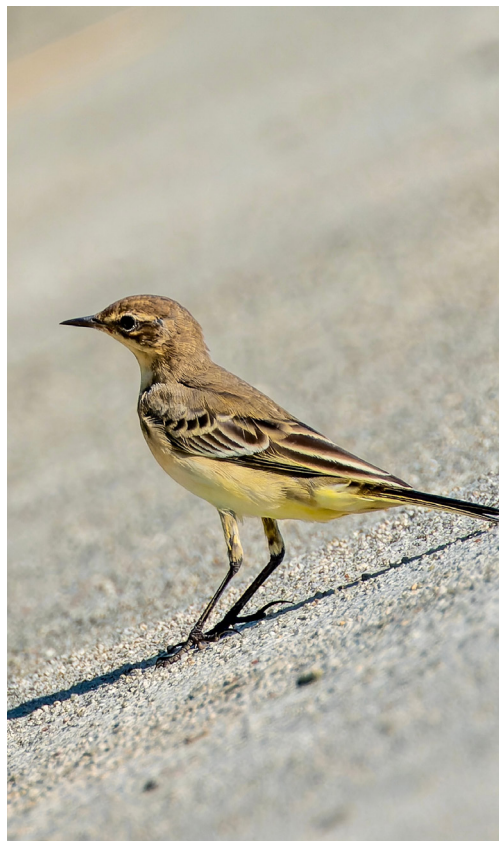
AL WARSAN BIRD SANCTUARY