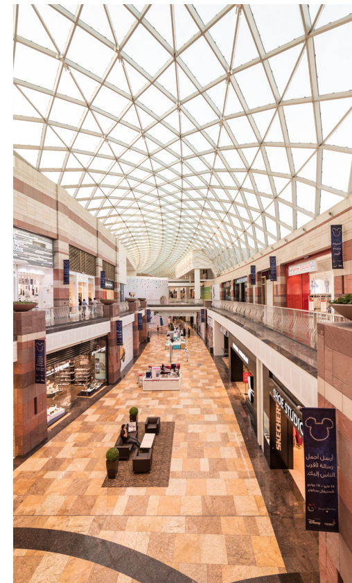
DUBAI FESTIVAL CITY MALL