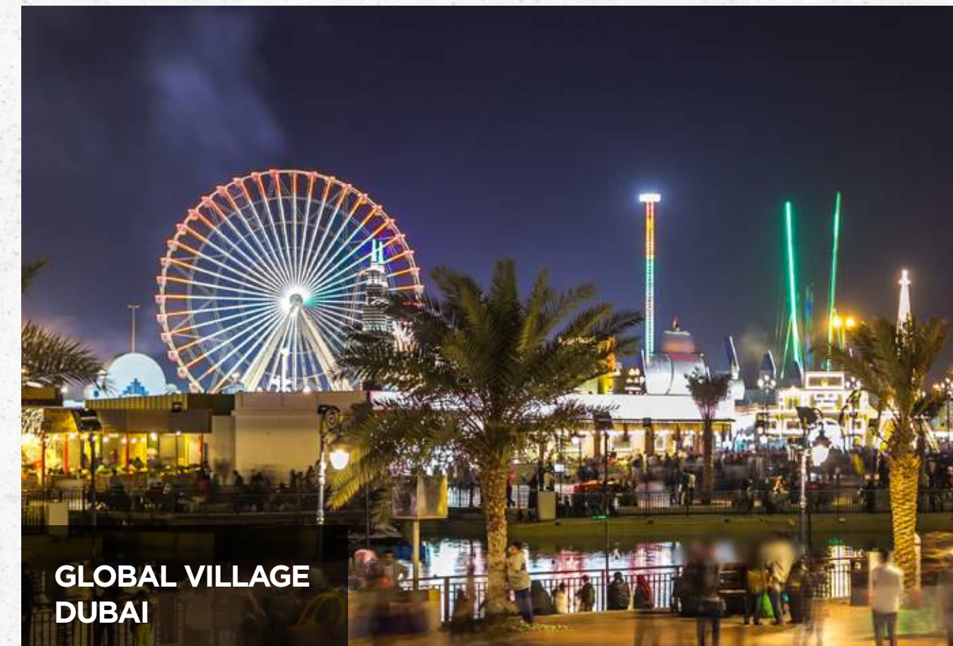
GLOBAL VILLAGE DUBAI