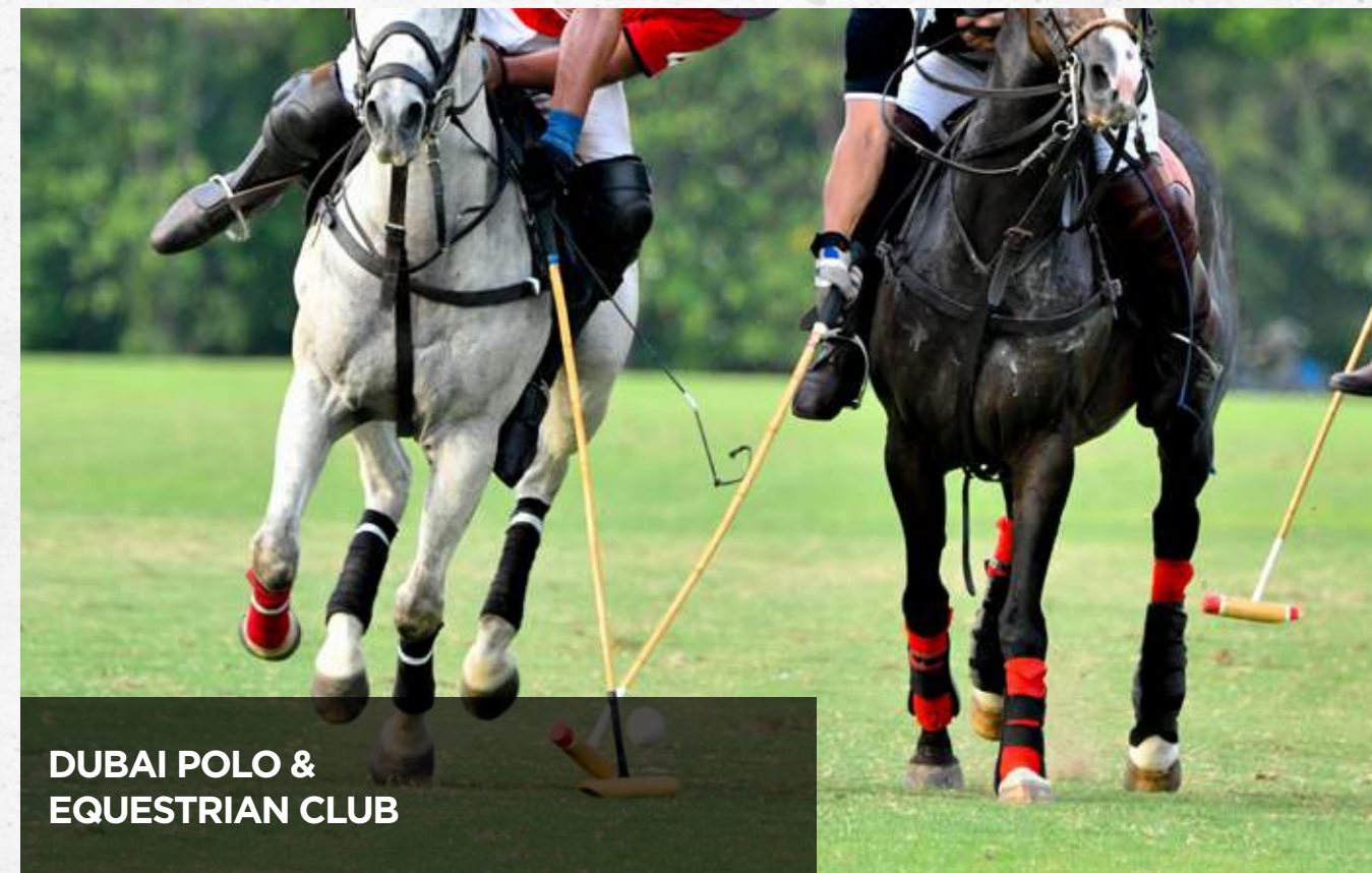
DUBAI POLO & EQUESTRIAN CLUB