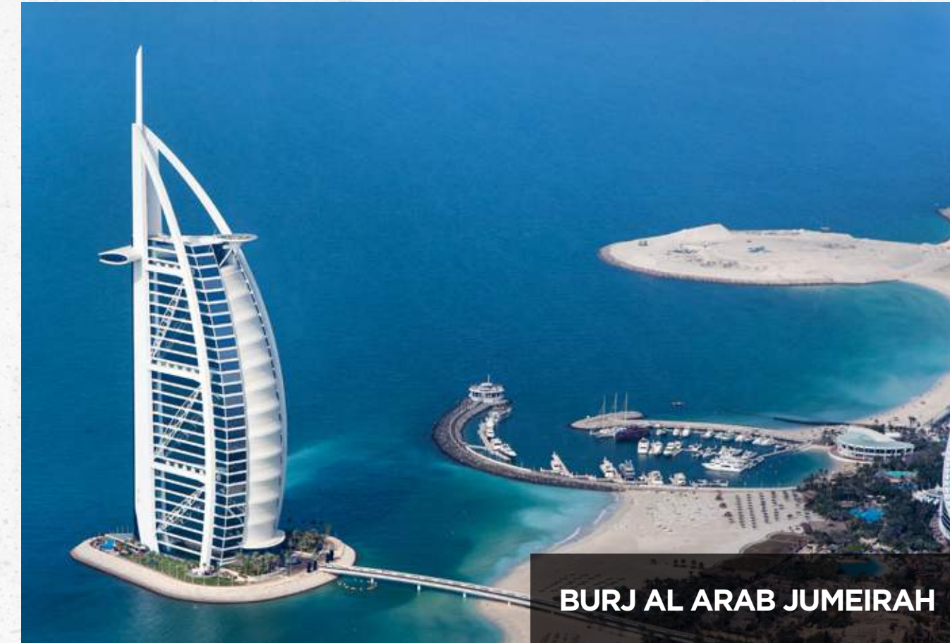
BURJ AL ARAB JUMEIRAH