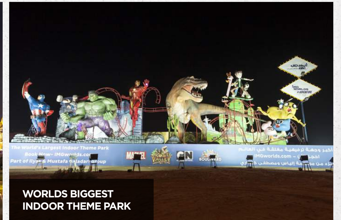
WORLDS BIGGEST INDOOR THEME PARK