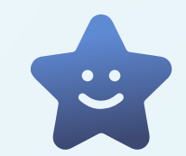
KIDS PLAY ROOM