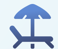
POOL DECK WITH SUN LOUNGERS