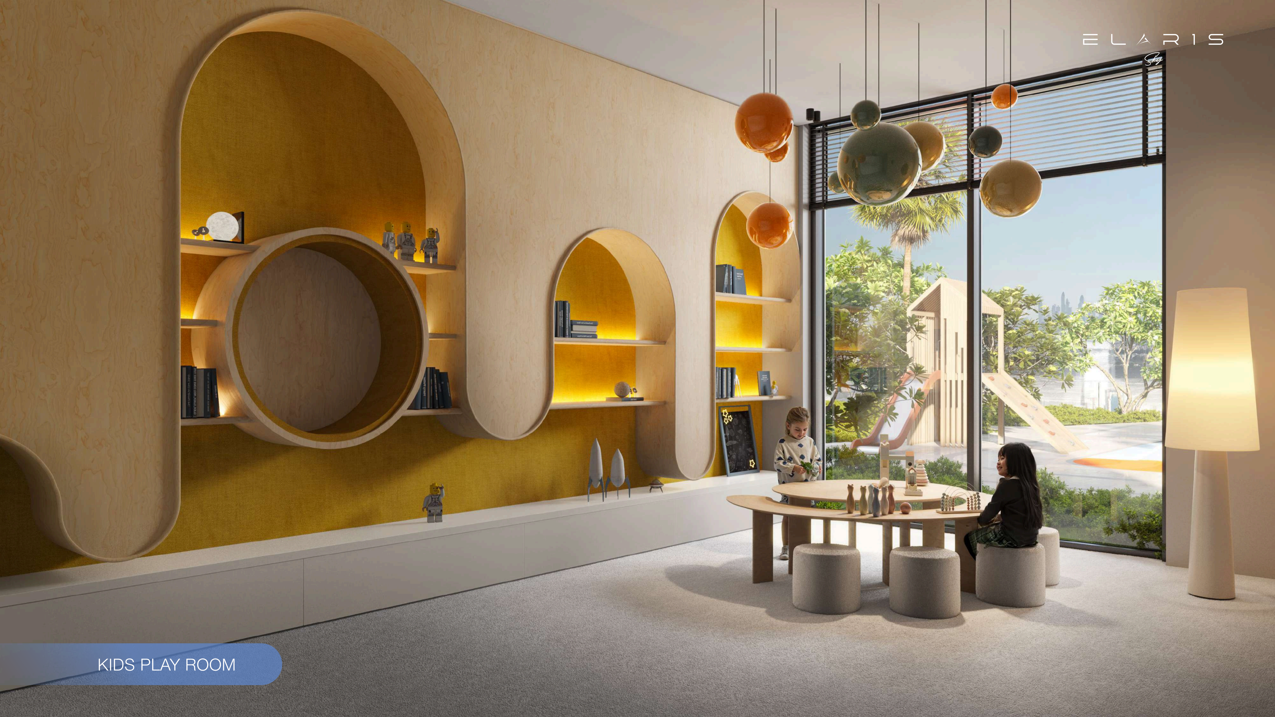
KIDS PLAY ROOM