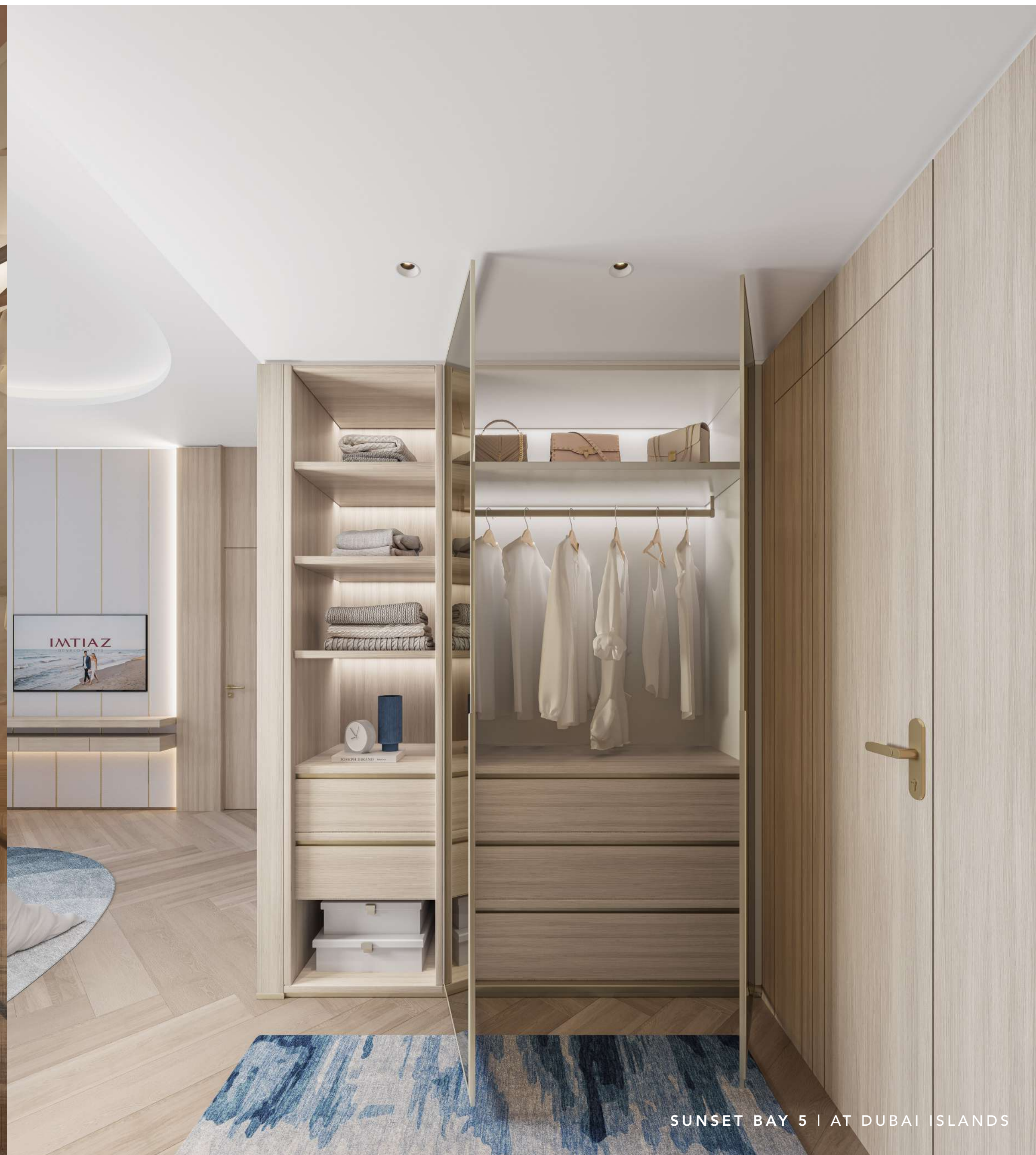
SUNSET BAY 5 | AT DUBAI ISLANDS