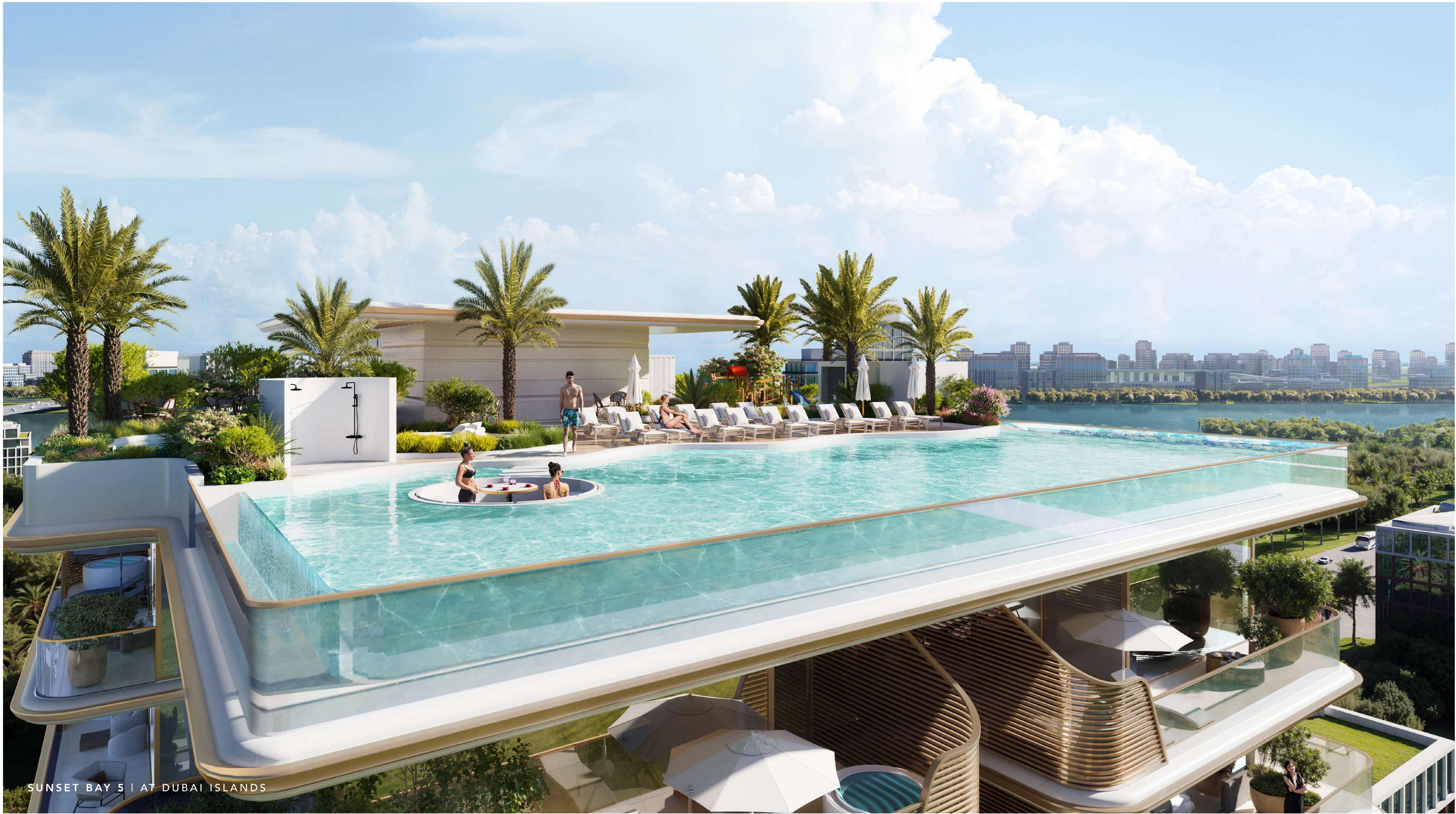
SUNSET BAY 5 | AT DUBAI ISLANDS