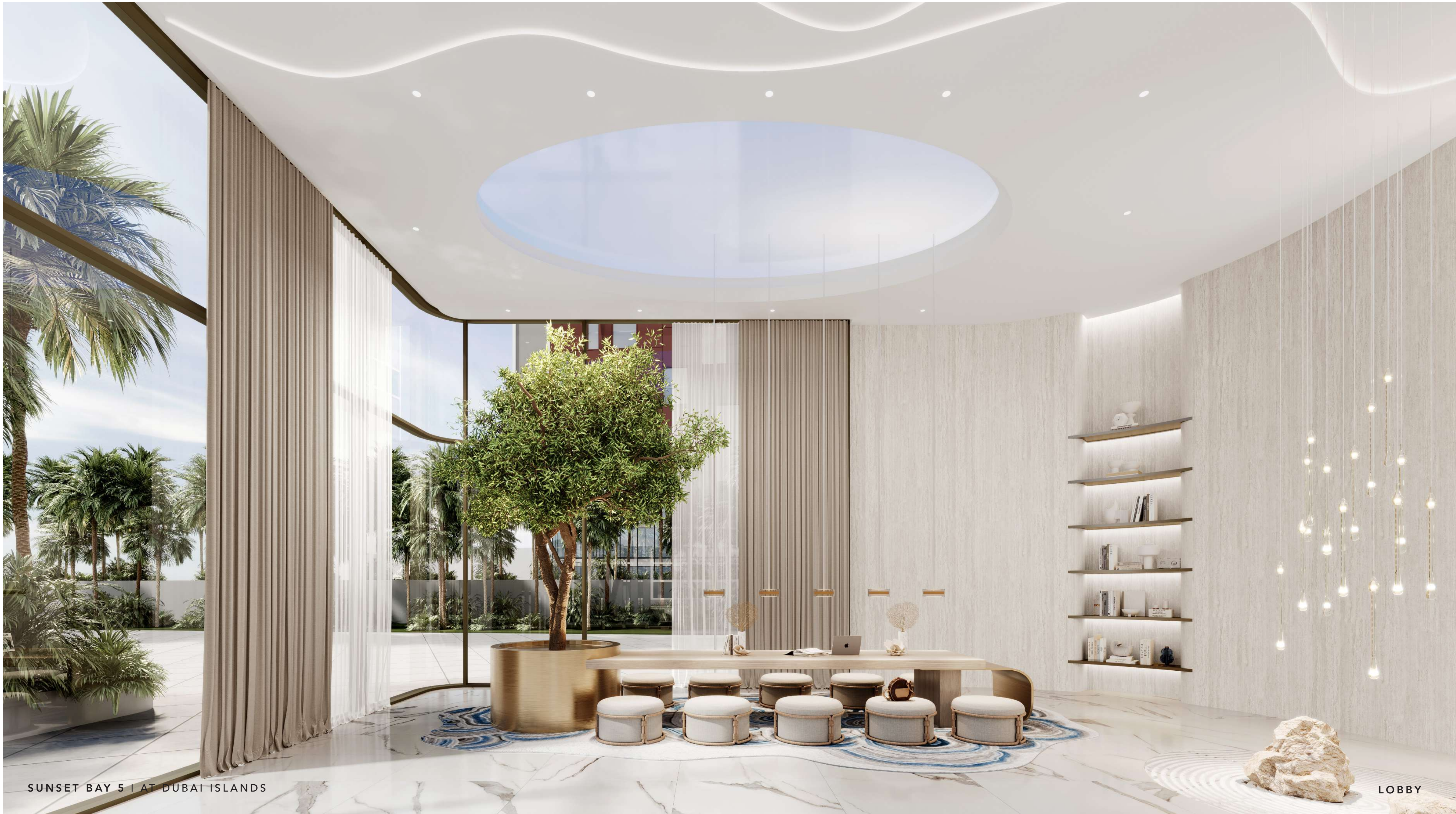
SUNSET BAY 5 | AT DUBAI ISLANDS