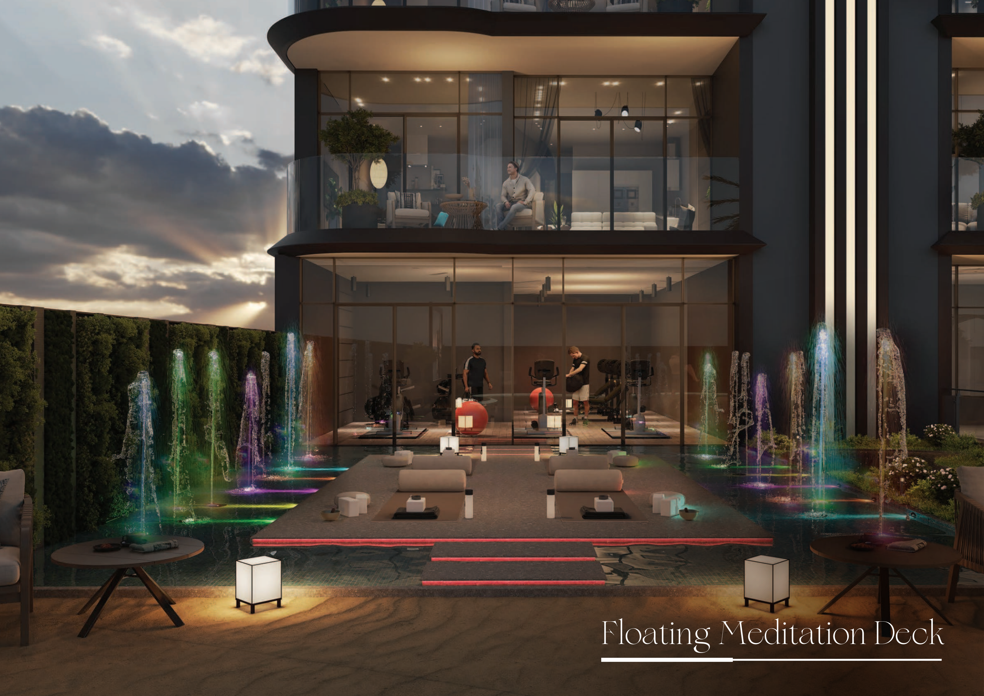
Floating Meditation Deck