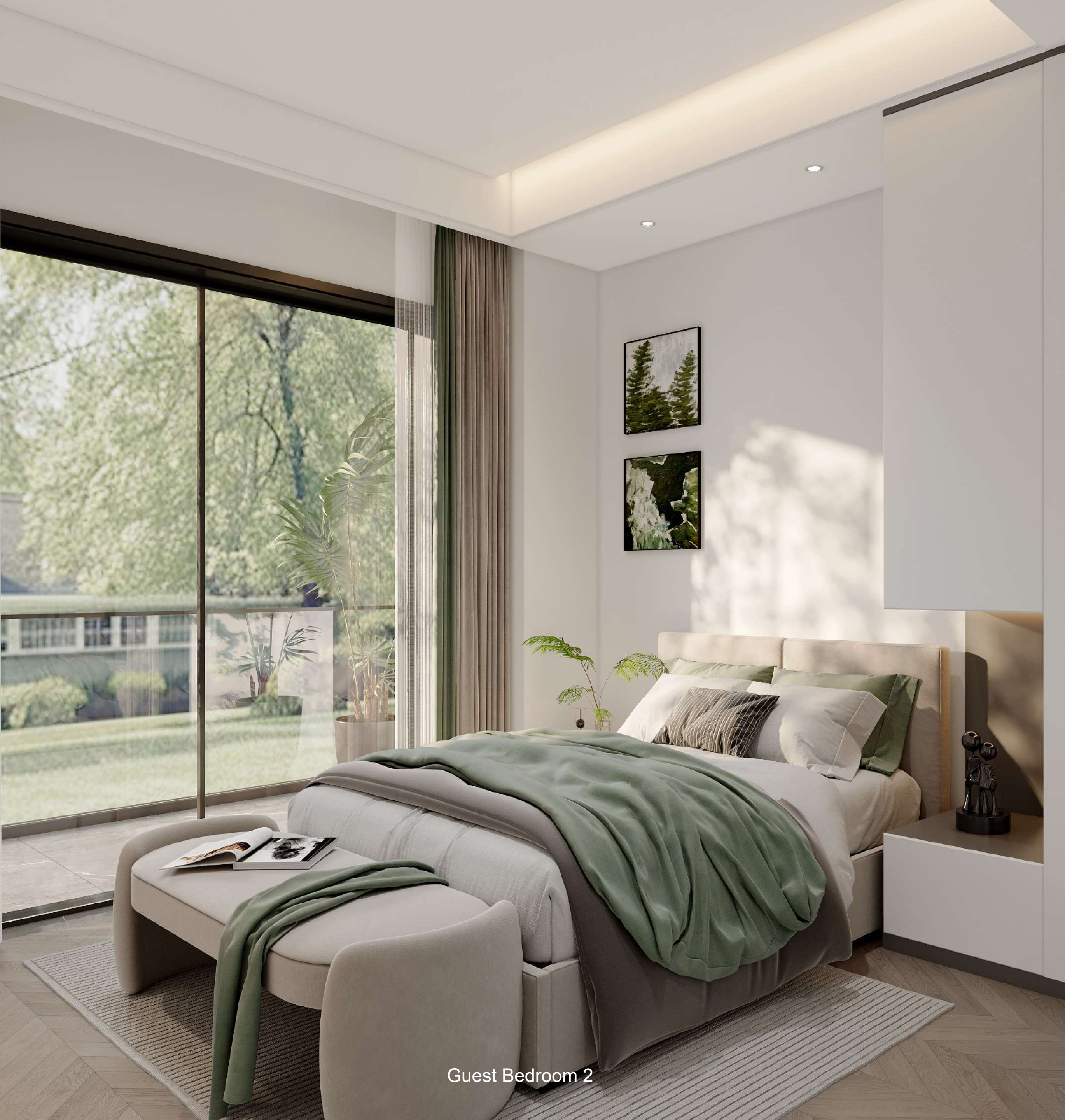
Guest Bedroom 2