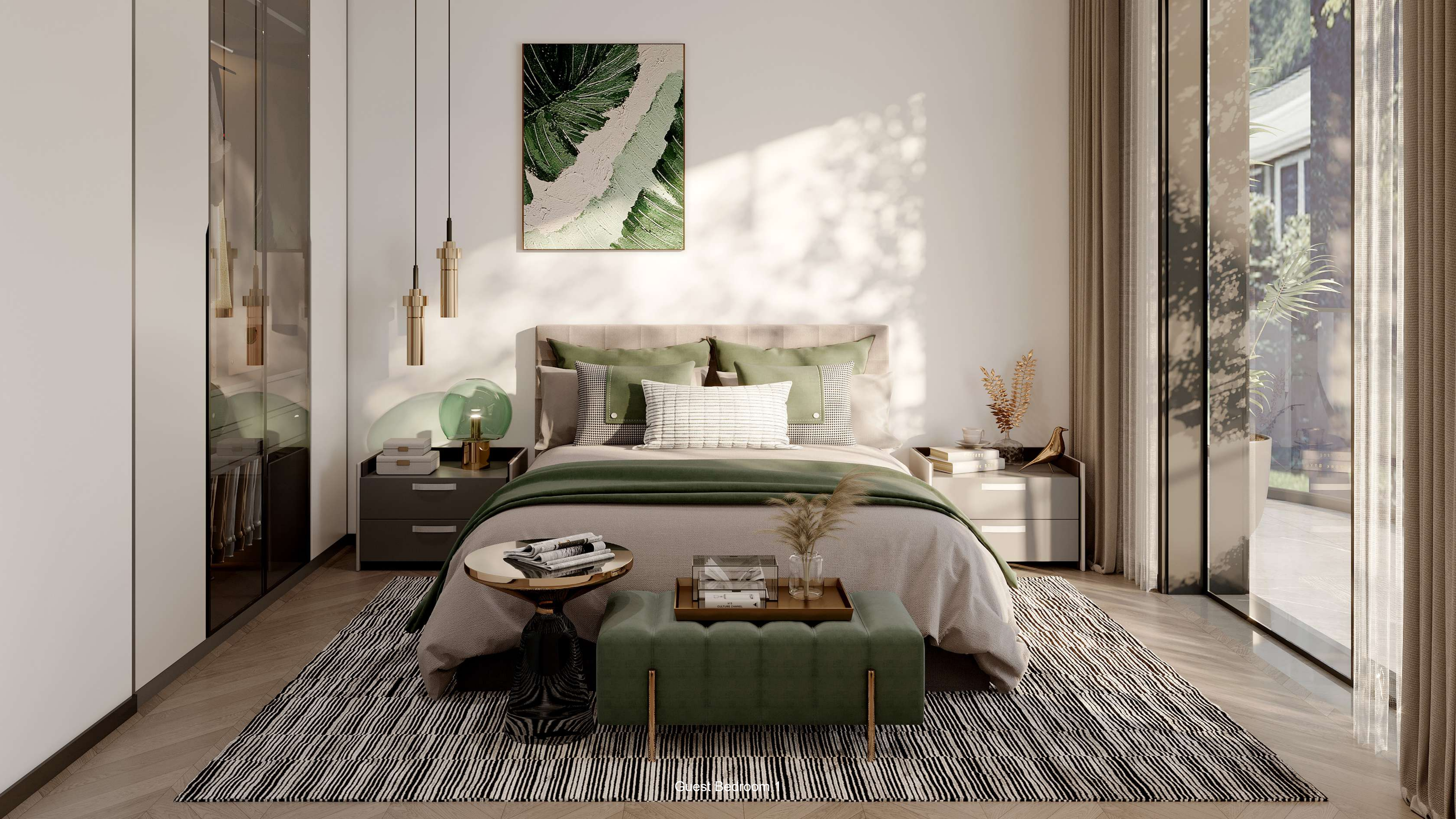
Guest Bedroom 1