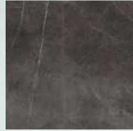
Pietra Grey Satin Natural