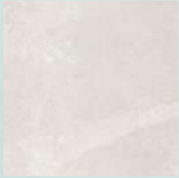
Eureka Bianco Natural