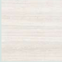
Sensi Roma White Natural