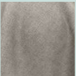
Collection Deluxe Feather Texture