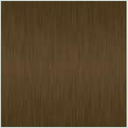
Brushed Bronze Finish