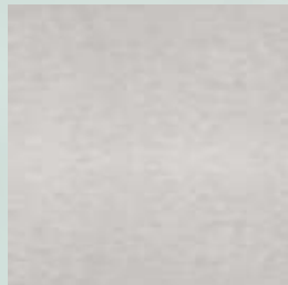
MJ Tessuti Naoki IN-FR