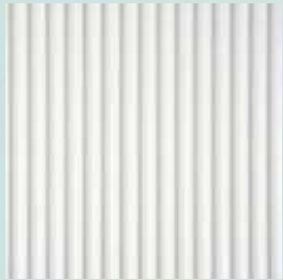
White Fluted Lacquered Wood