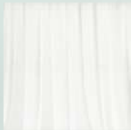
Warwick Gianna Vanilla Curtain