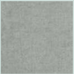
Collection Deluxe Wallpaper