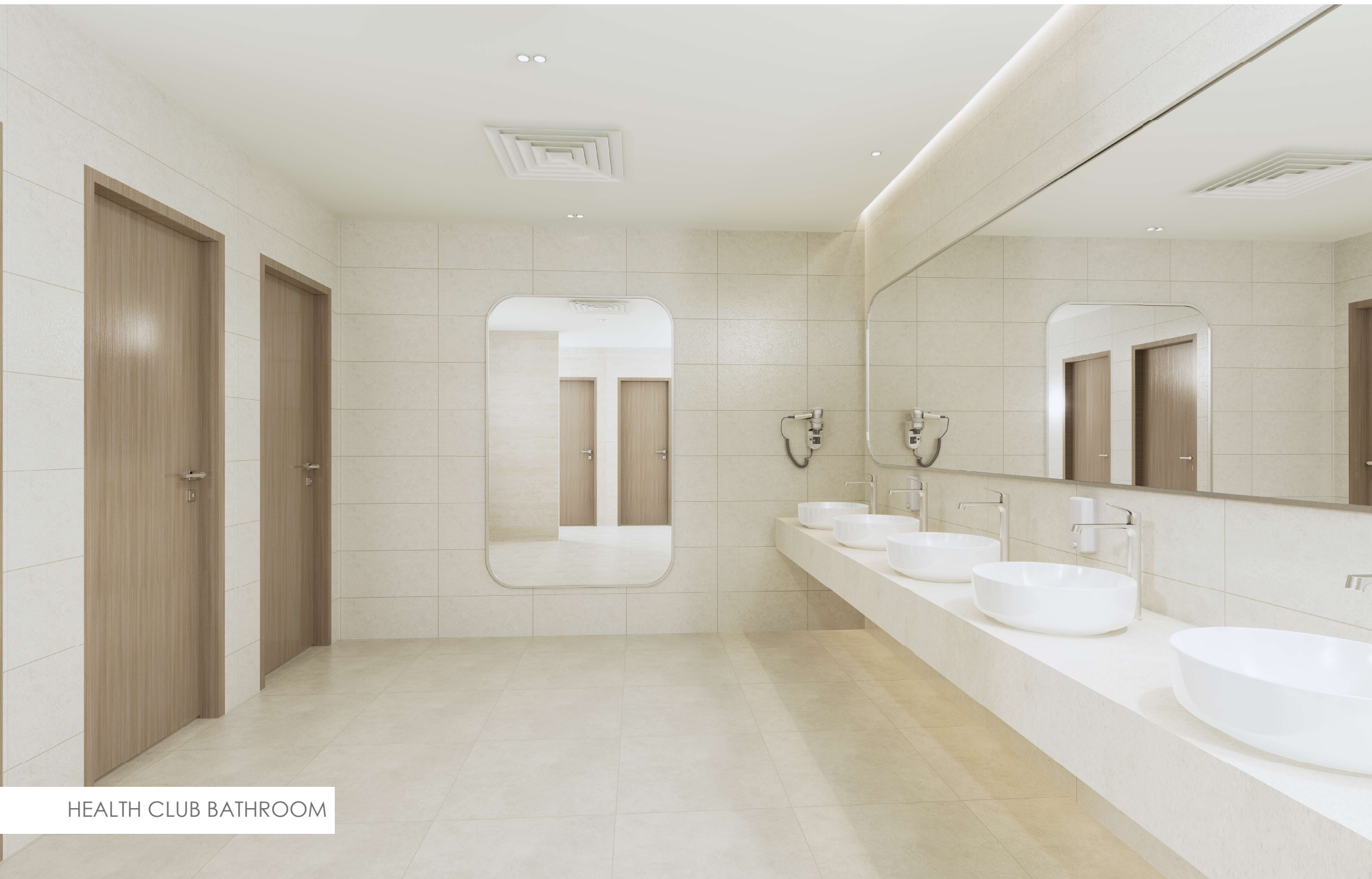
HEALTH CLUB BATHROOM