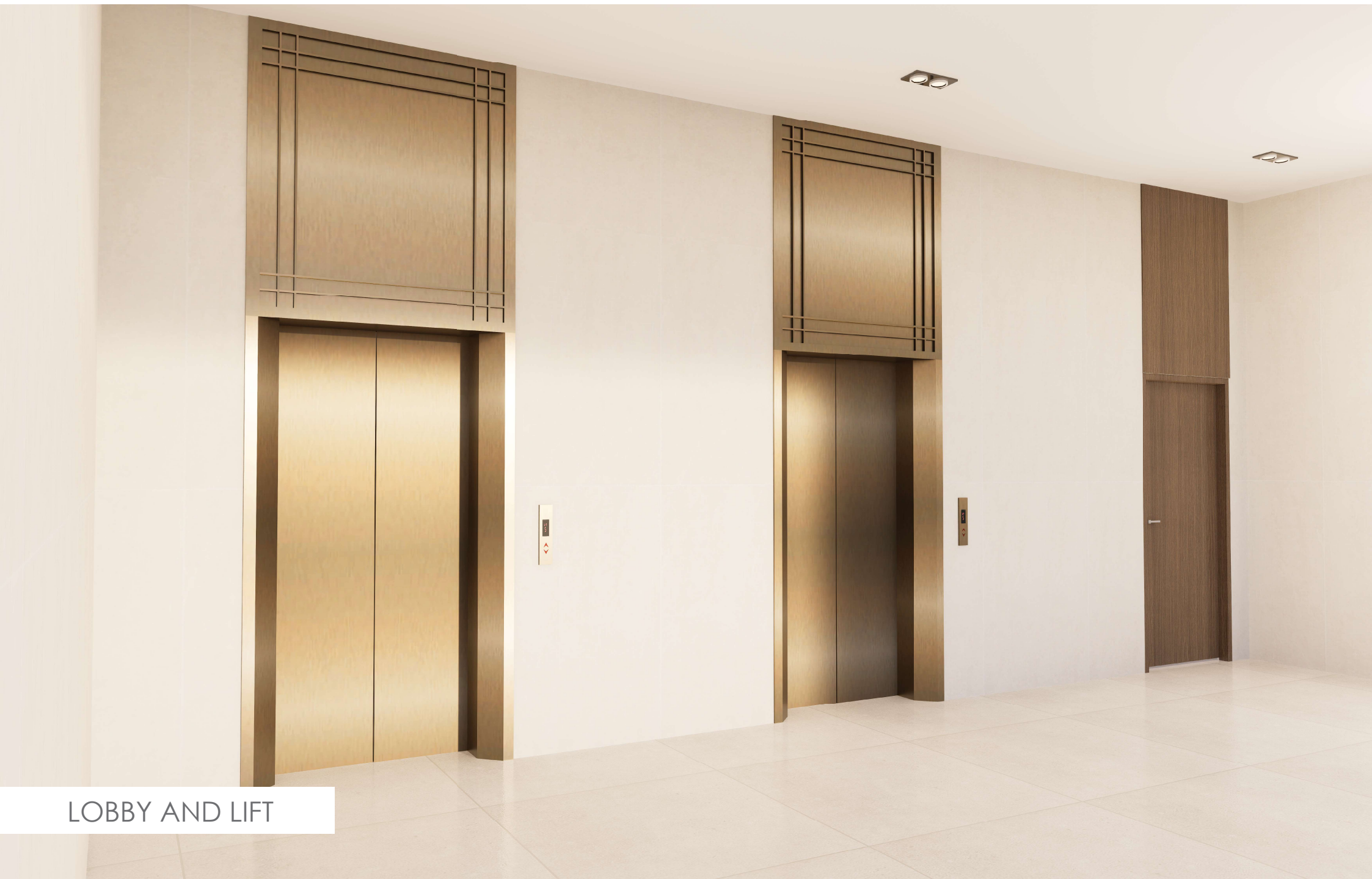
LOBBY AND LIFT