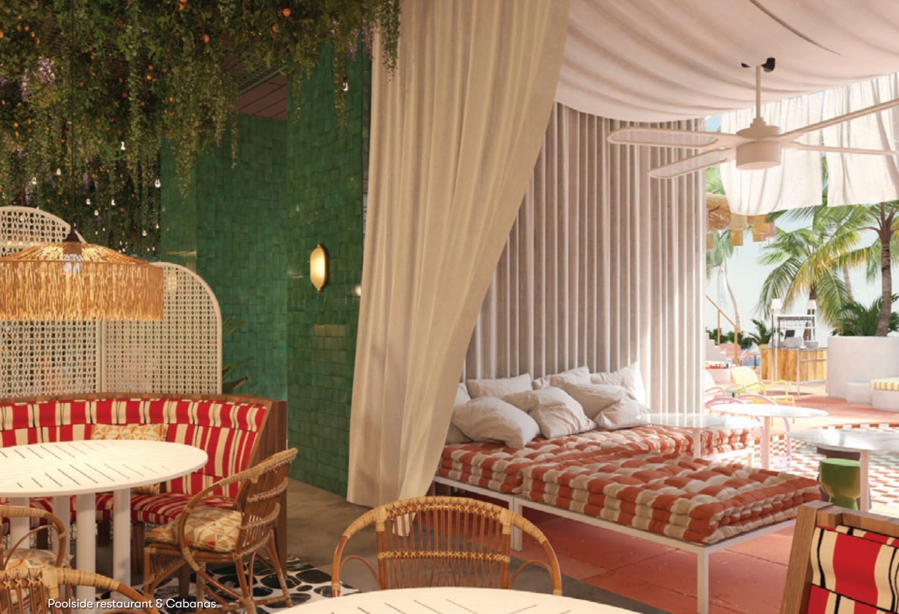
Poolside restaurant & Cabanas