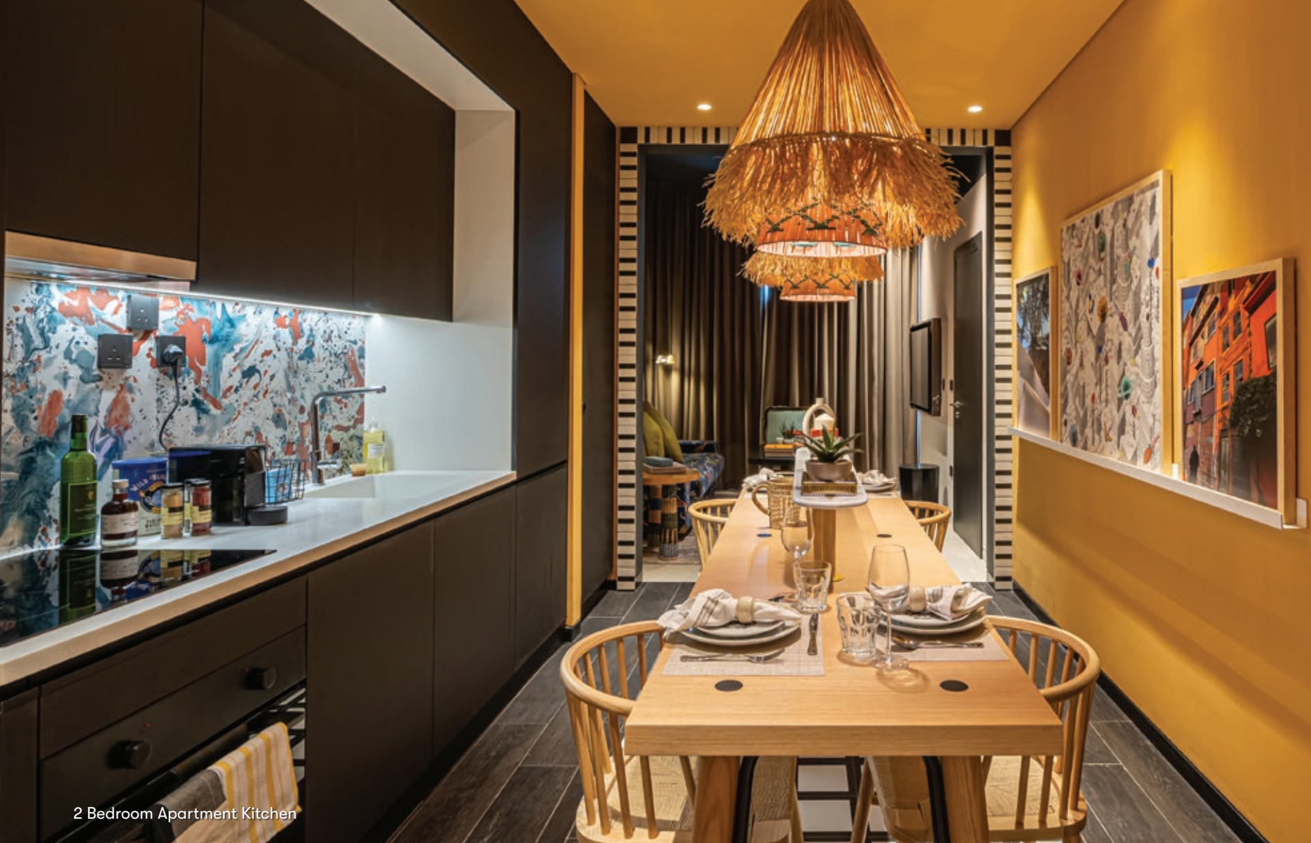
2 Bedroom Apartment Kitchen