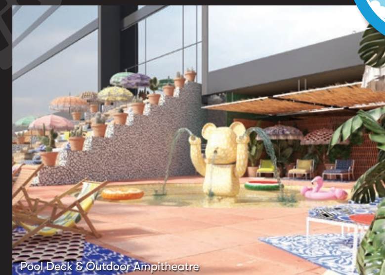
Pool Deck & Outdoor Ampitheatre