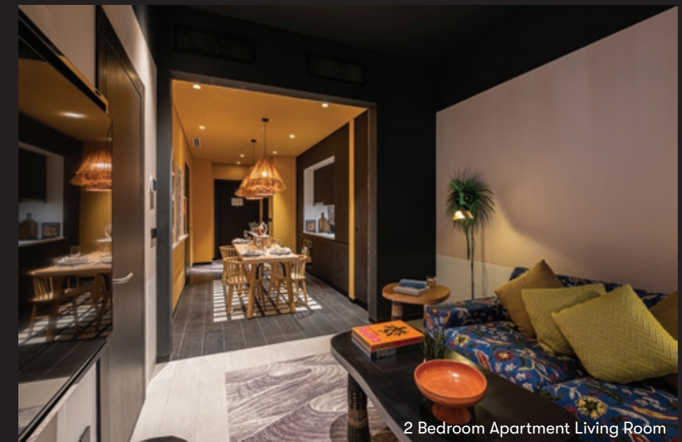
2 Bedroom Apartment Living Room