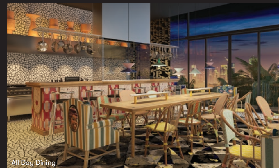
All Day Dining