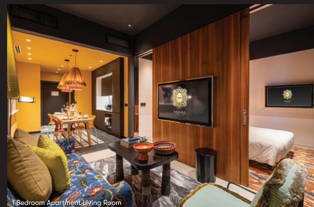
1 Bedroom Apartment Living Room

With exceptional hotel amenities and hospitality services provided by the global lifestyle hotel leader Ennismore to complete the picture, this fusion of world-class, leading hospitality and the ultimate in-home design makes this an unmatched choice in Dubai. Step inside and start living. With personalized free WiFi, a virtual concierge, a top-notch in-room entertainment system with TV and free movies on demand in every apartment... Nothing is too much to imagine for Mama!