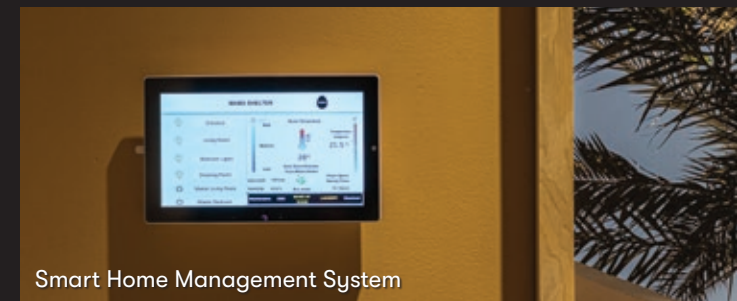
Smart Home Management System