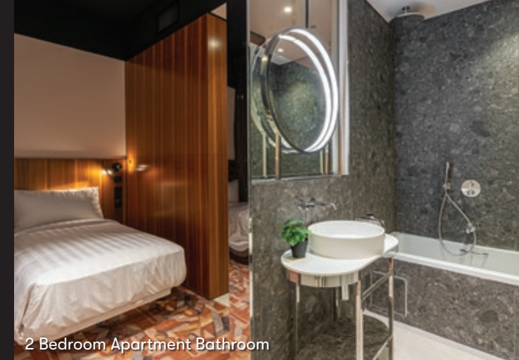
2 Bedroom Apartment Bathroom