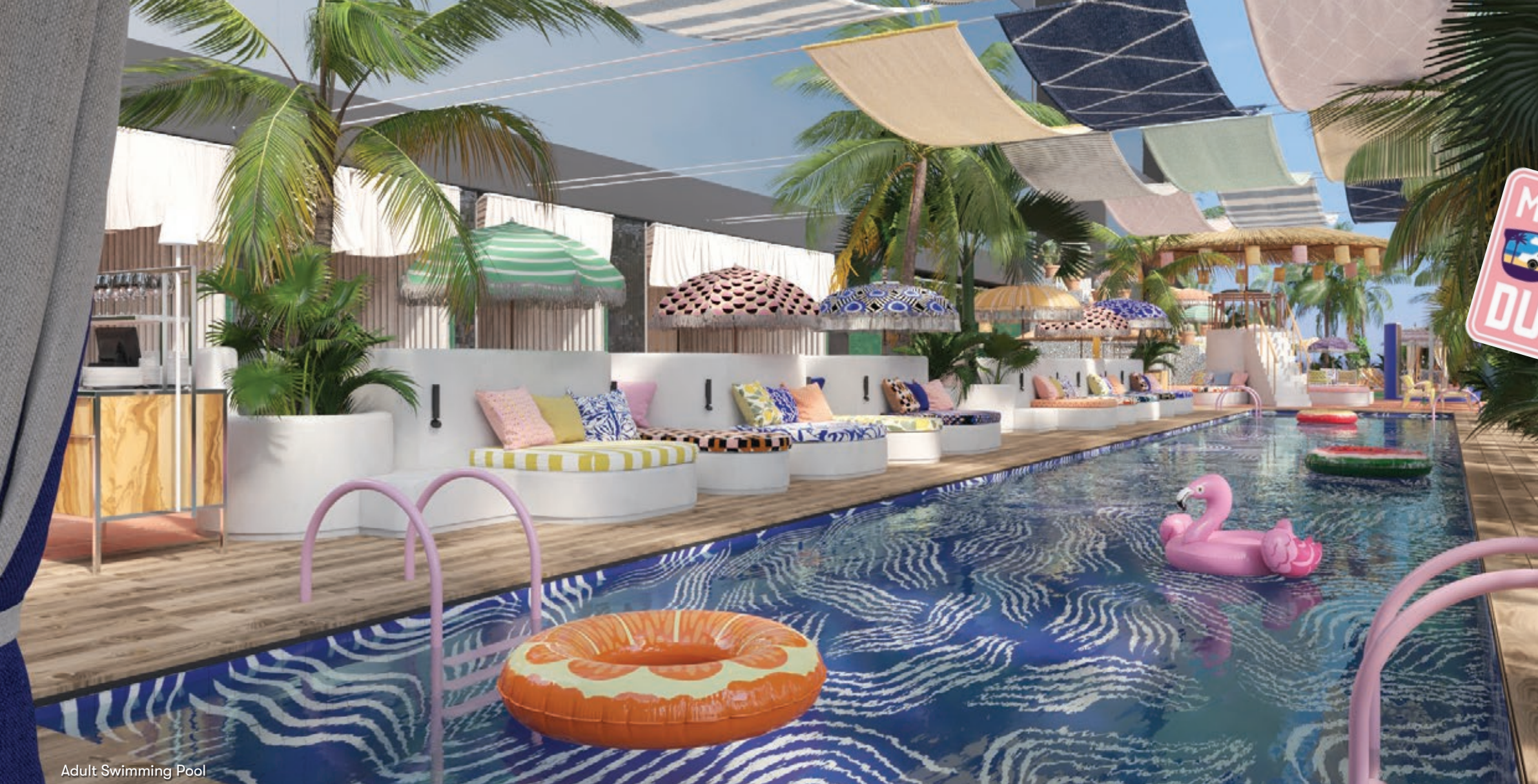
Adult Swimming Pool