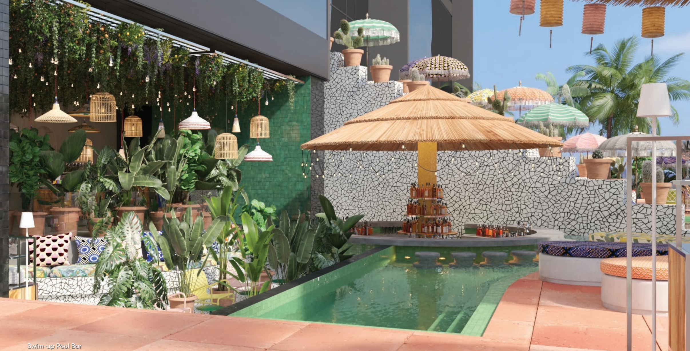
Swim-up Pool Bar