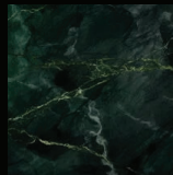
Furniture Green Marble