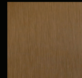
Warm Bronze Stainless Steel - Brush Finish