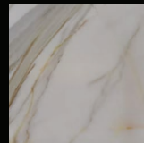
Furniture - Brown Calacatta Marble