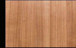
High Quality Laminated Wood