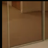
Wardrobe Doors Brown Tinted Glass