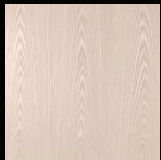
Walls - Wood Veneer