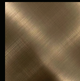
Dark Bronze - Stainless Steel Brush Finish