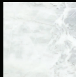
Luxury Wall Paper