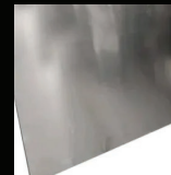
Warm Bronze - Stainless Steel Reflective Marble

* The images (only) shown are for illustrative purposes and may not accurately represent the actual materials used in the project.