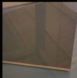
Walls - Brown Tinted Glass