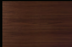
Wall Art - Brown Wood