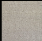
Furniture Fabric - 2