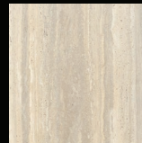
Kitchen & Bathroom Travertine Marble