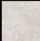
Flooring - Crema Marble