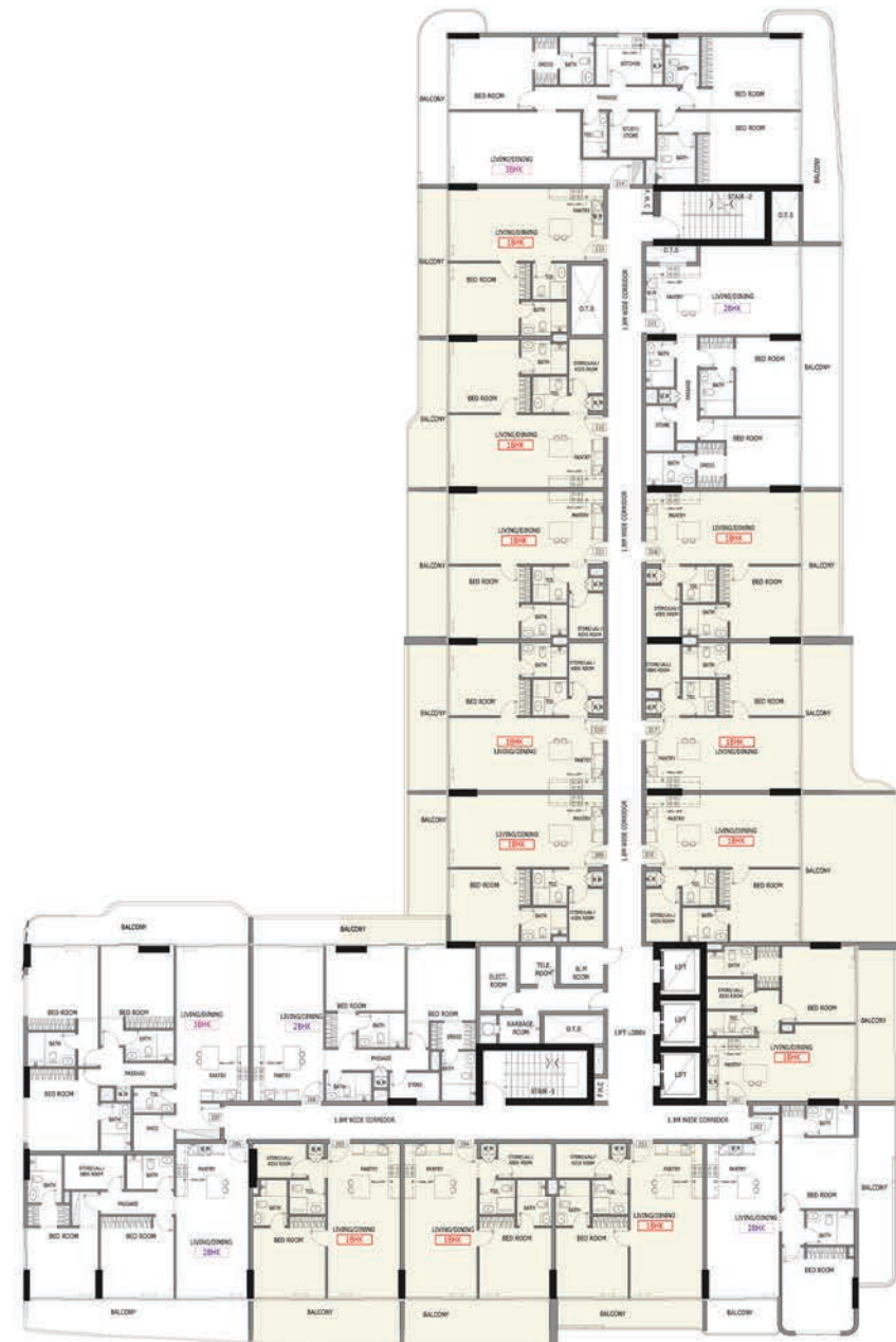
Key Plan | 2 ND Floor