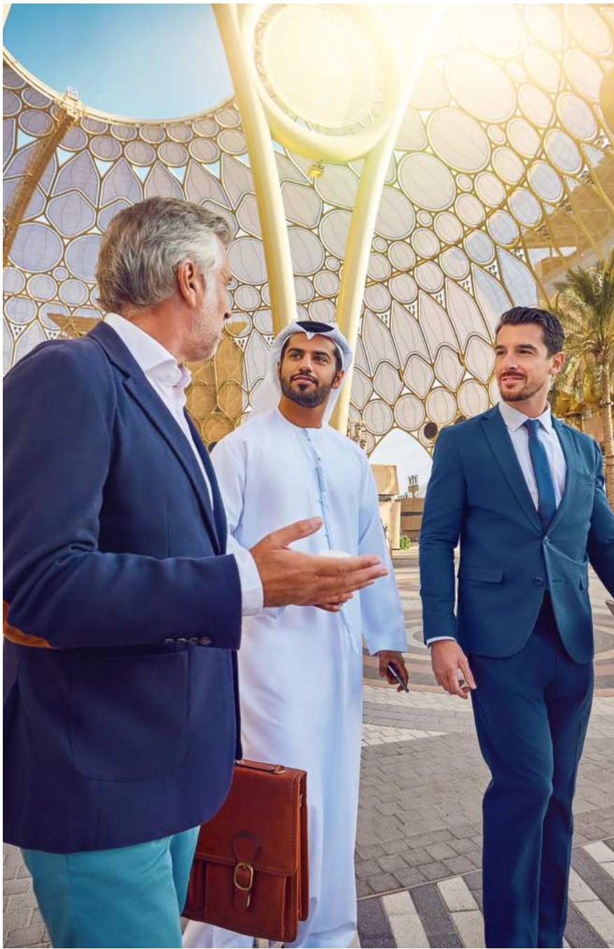
Five minutes from Al Wasl Plaza with its outdoor performances and immersive projections