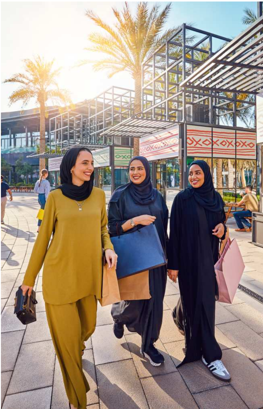
Within easy reach of the community square, offices, theatre, 5-star hotel, the Expo City market and numerous restaurants and retail outlets

سدر ريزيدنسز SIDR RESIDENCES في مدينة إكسبو دبي AT EXPO CITY DUBAI