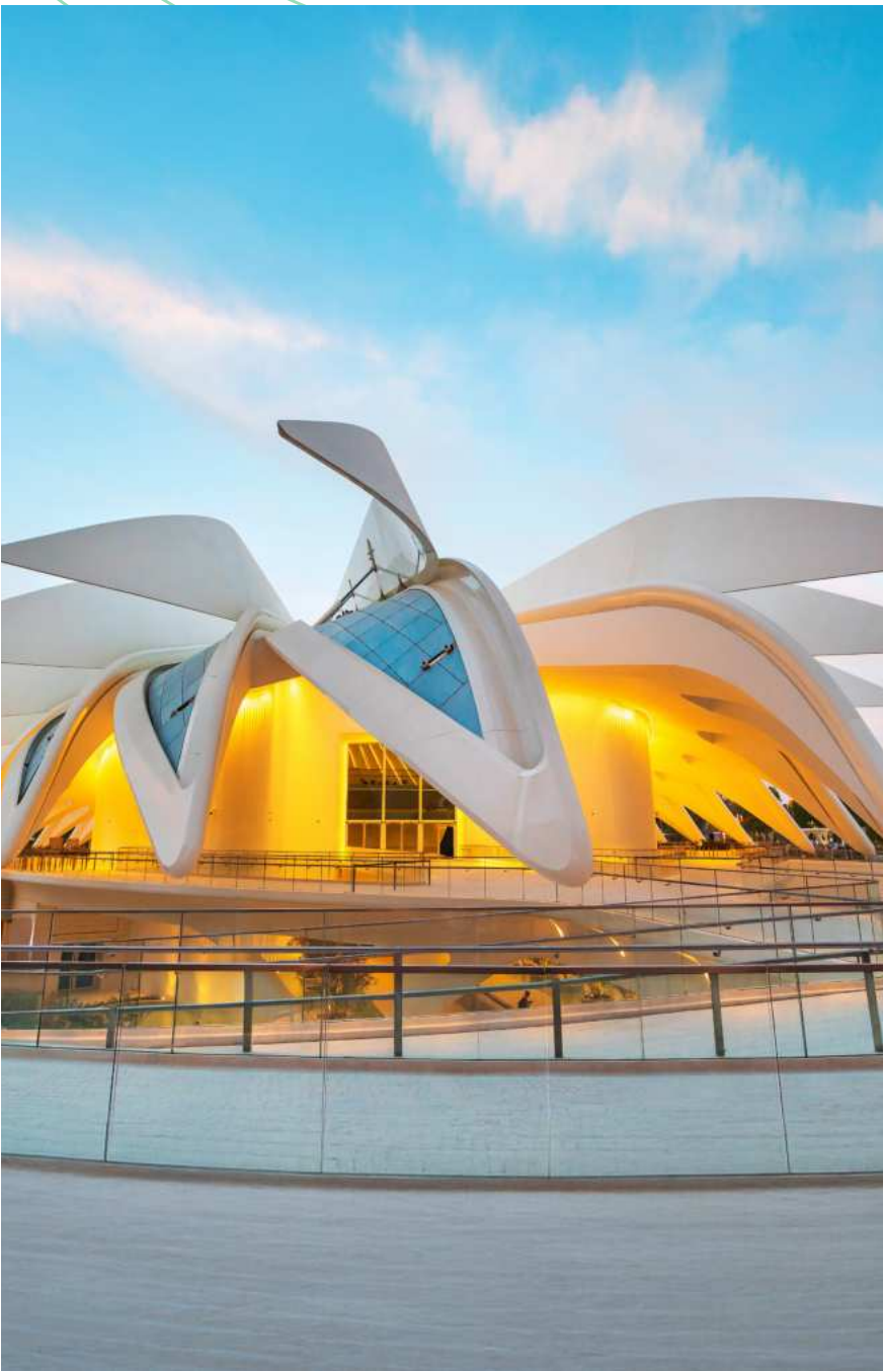
Direct access to the UAE Pavilion via the lush Ghayath Trail