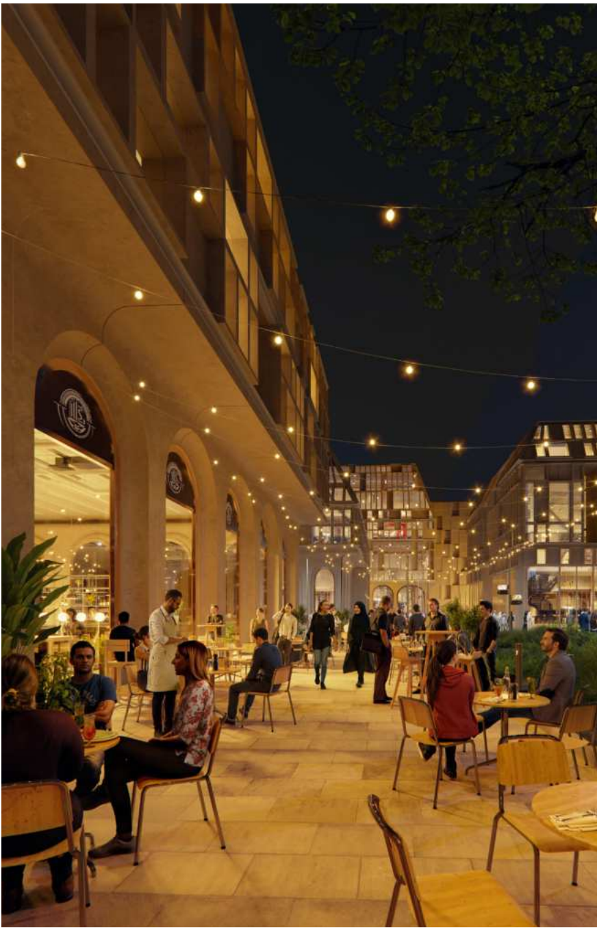
Bordering Expo Business offering prime connections to high-end professional opportunities as well as extensive dining and retail options