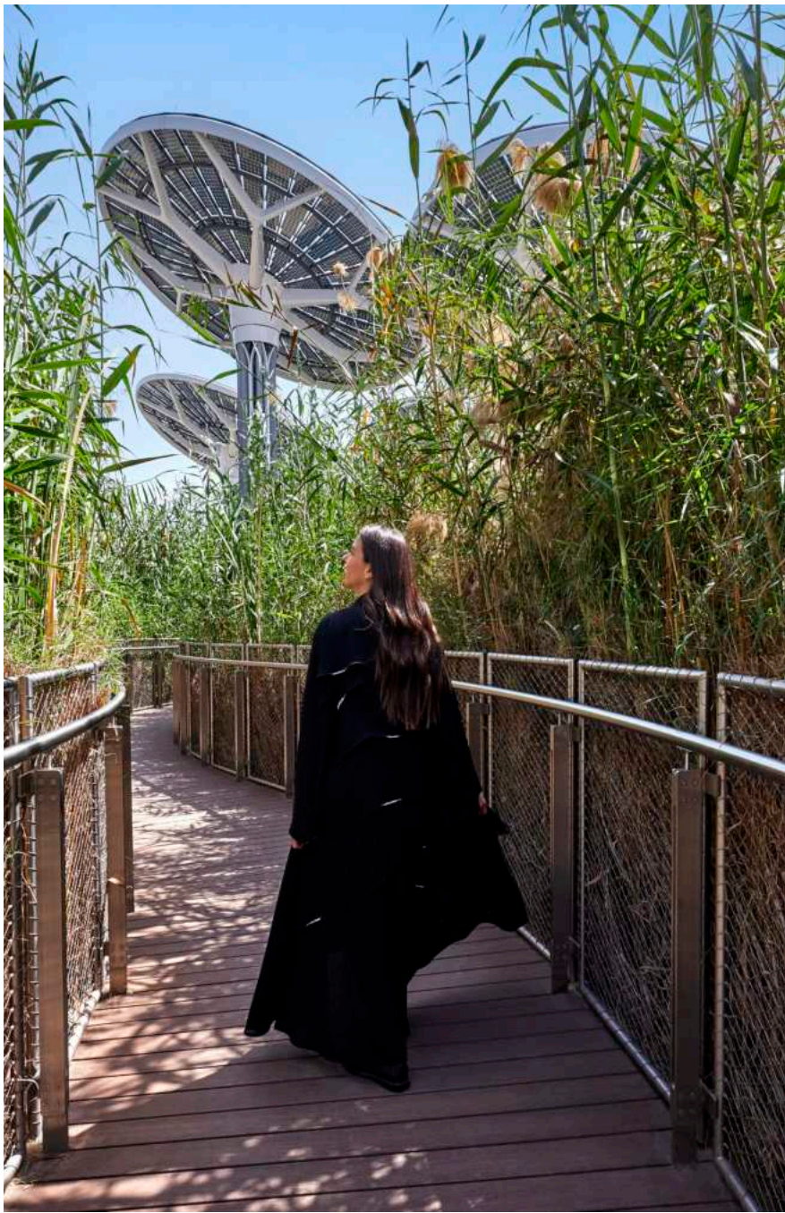
Sweeping outlooks across Al Wasl Plaza, the UAE Pavilion and Terra, with views of Surreal water feature from higher floors