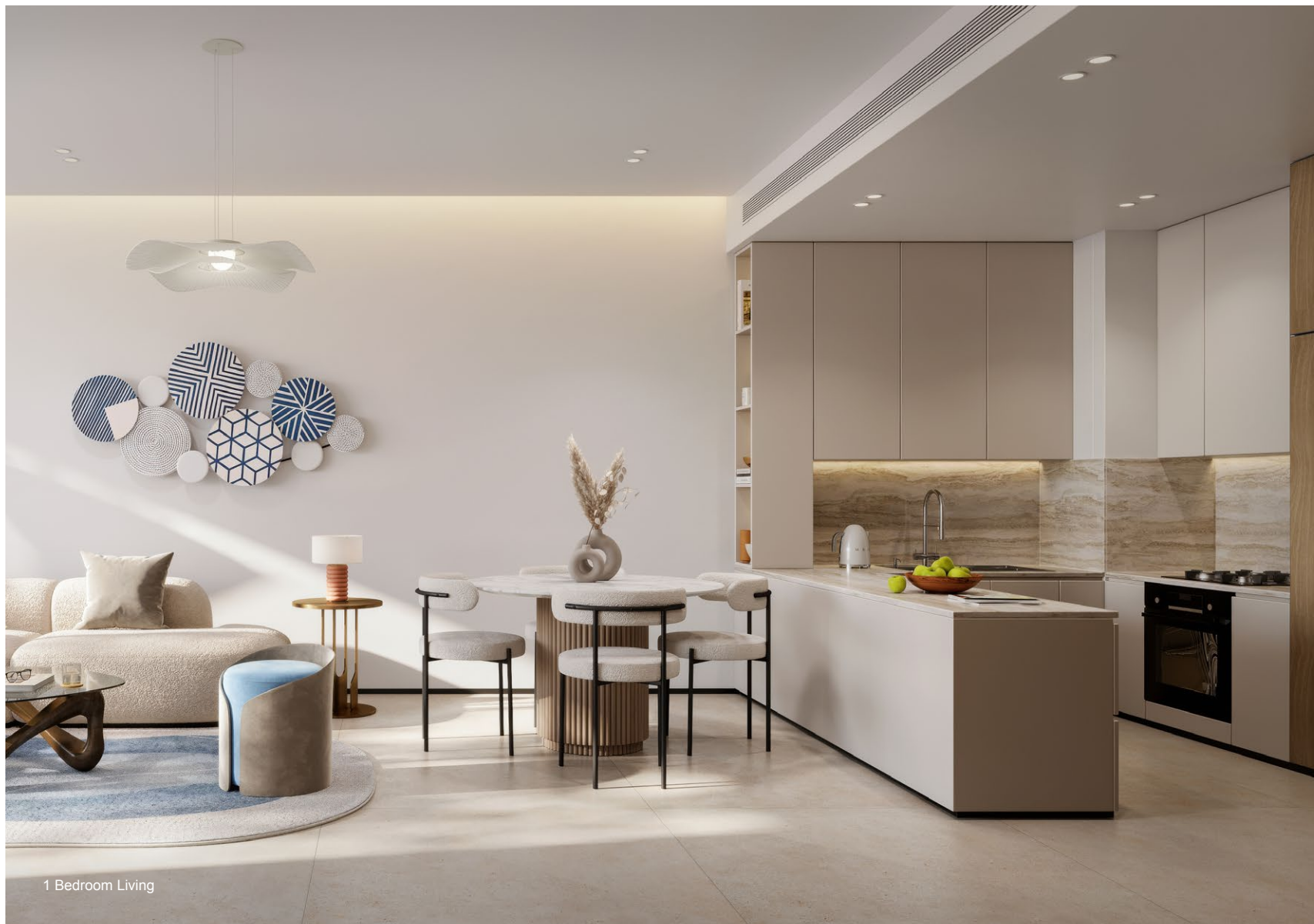
1 Bedroom Living