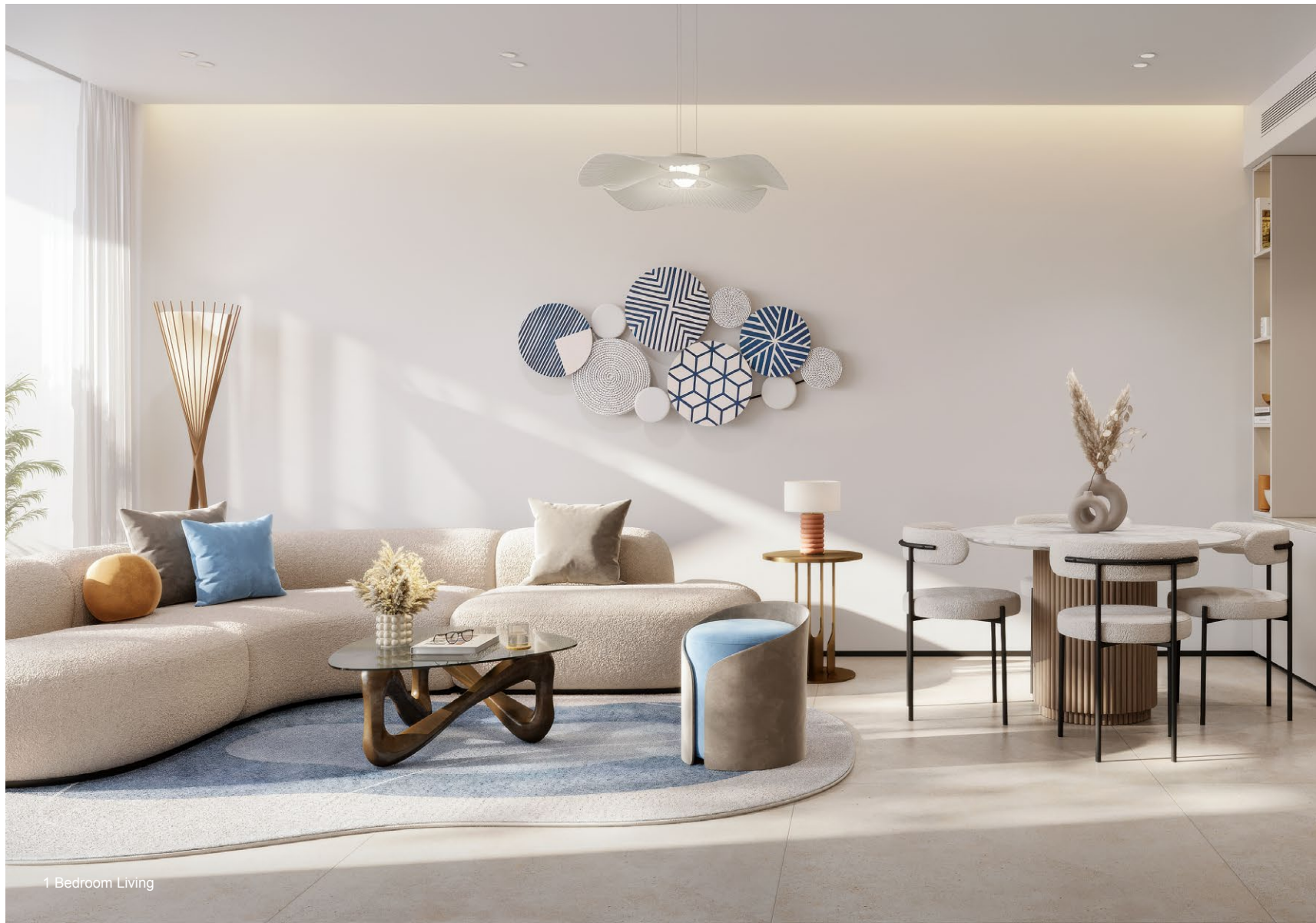
1 Bedroom Living