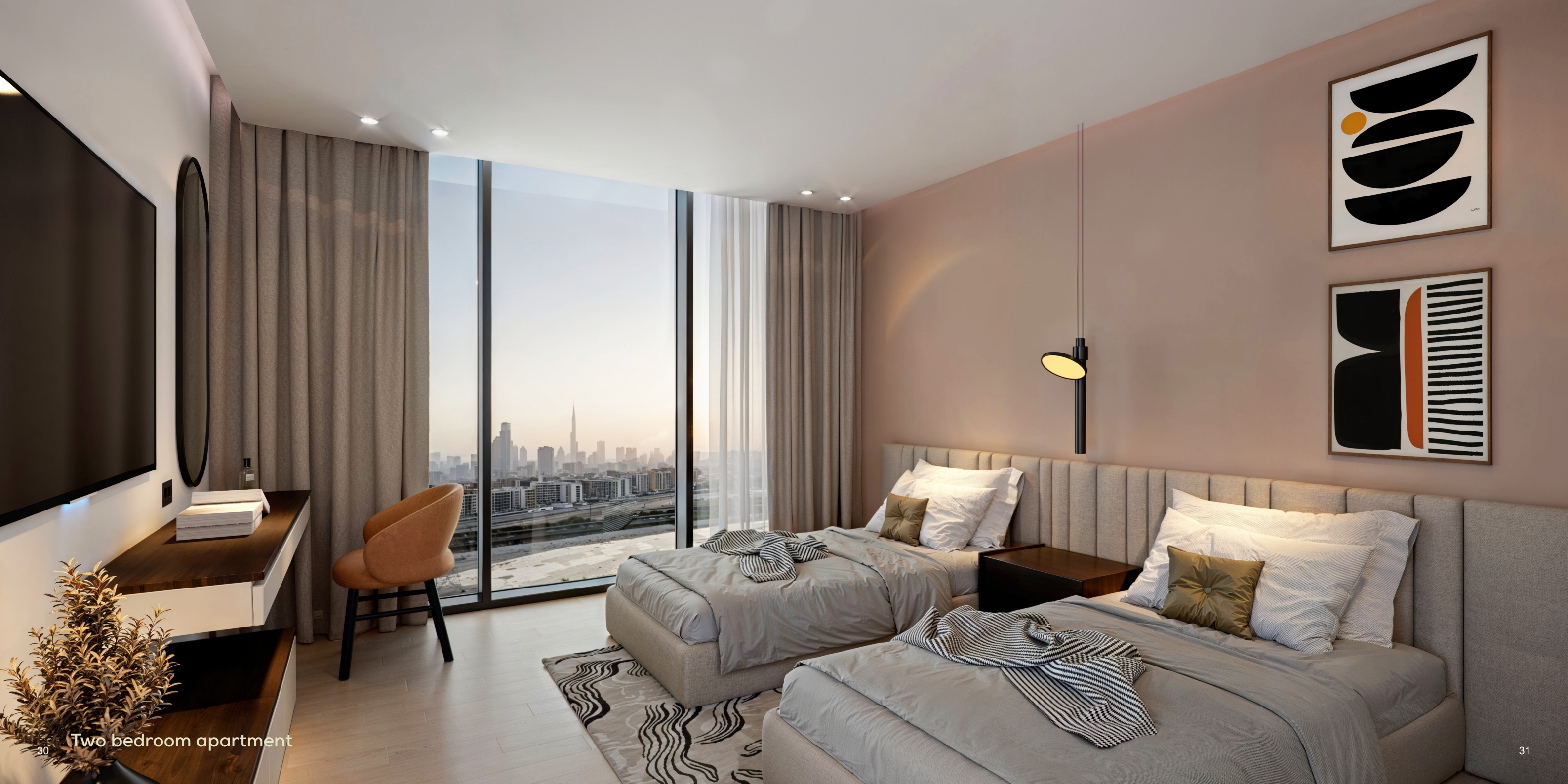
Two bedroom apartment