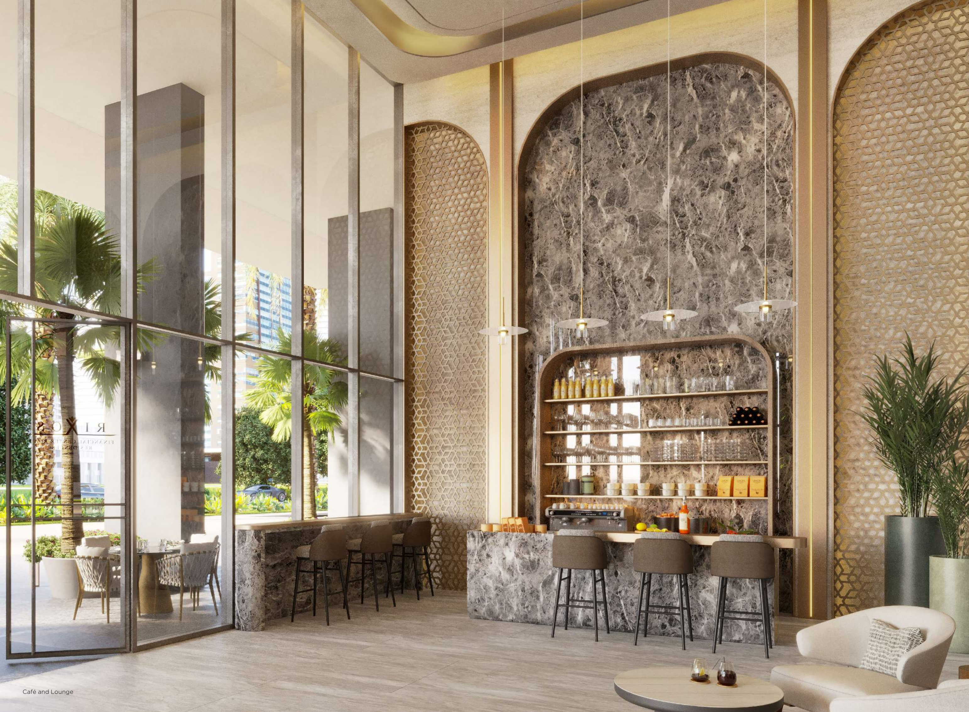
Café and Lounge