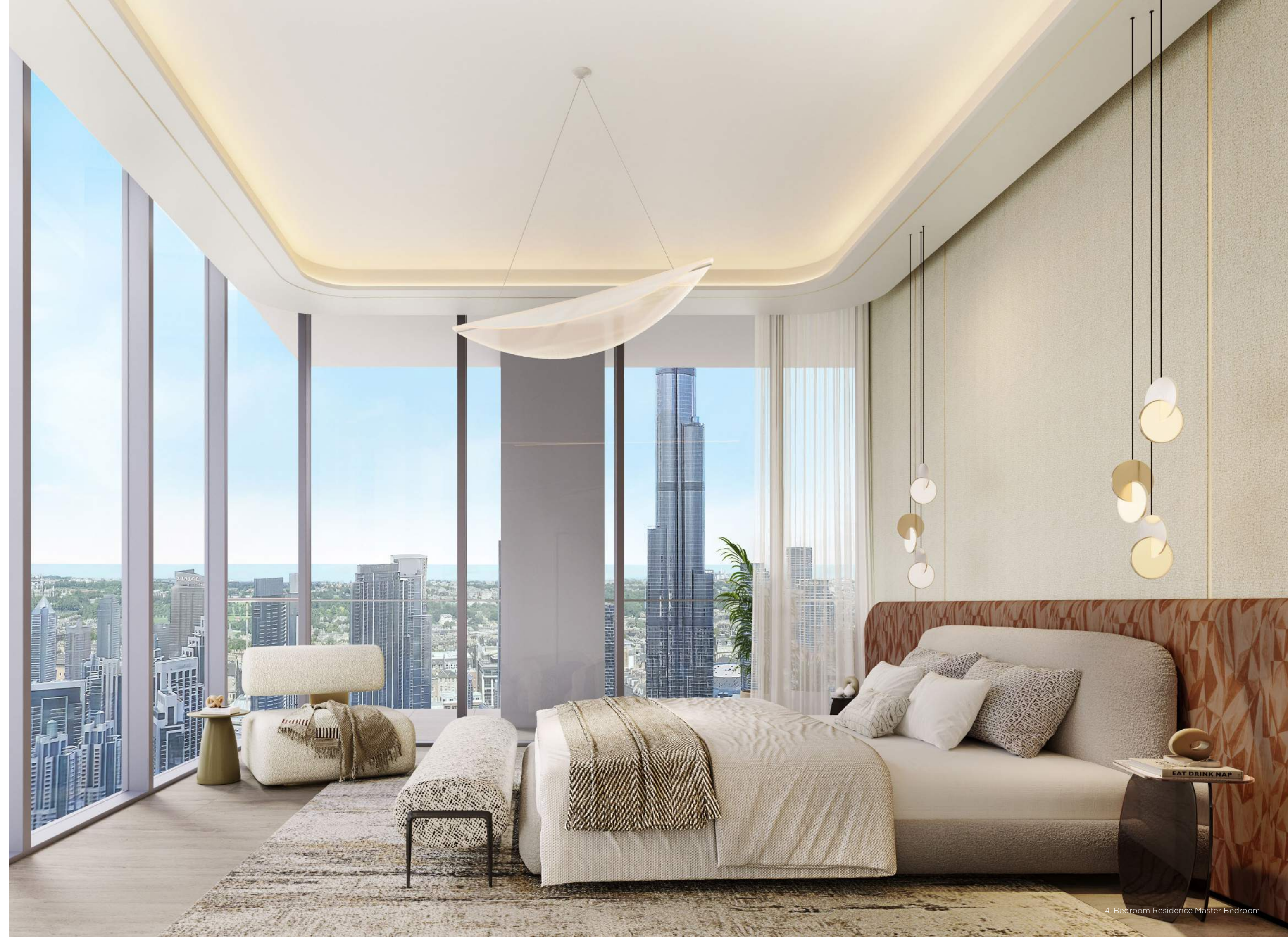
4-Bedroom Residence Master Bedroom

These residences feature carefully curated patterns and textures to enhance the living spaces, allowing natural light to flood in and create an airy atmosphere.