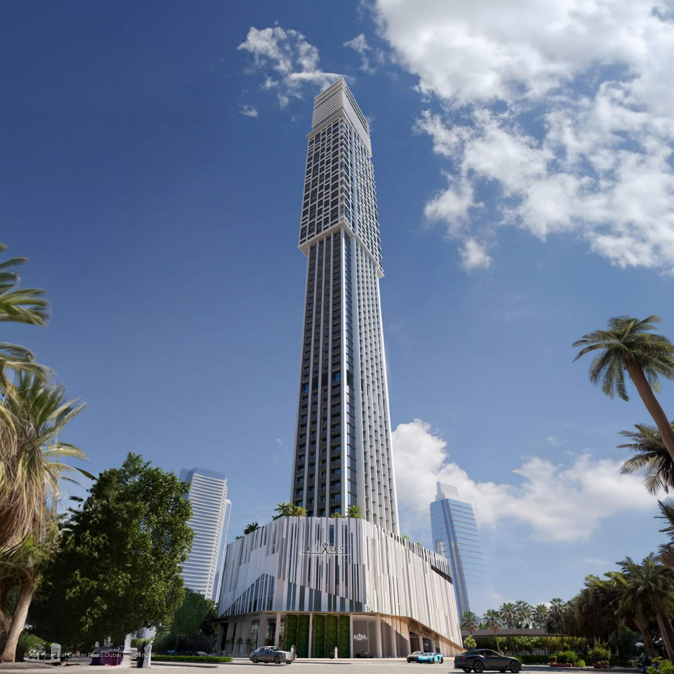
Rixos Financial Center Road Dubai Residences