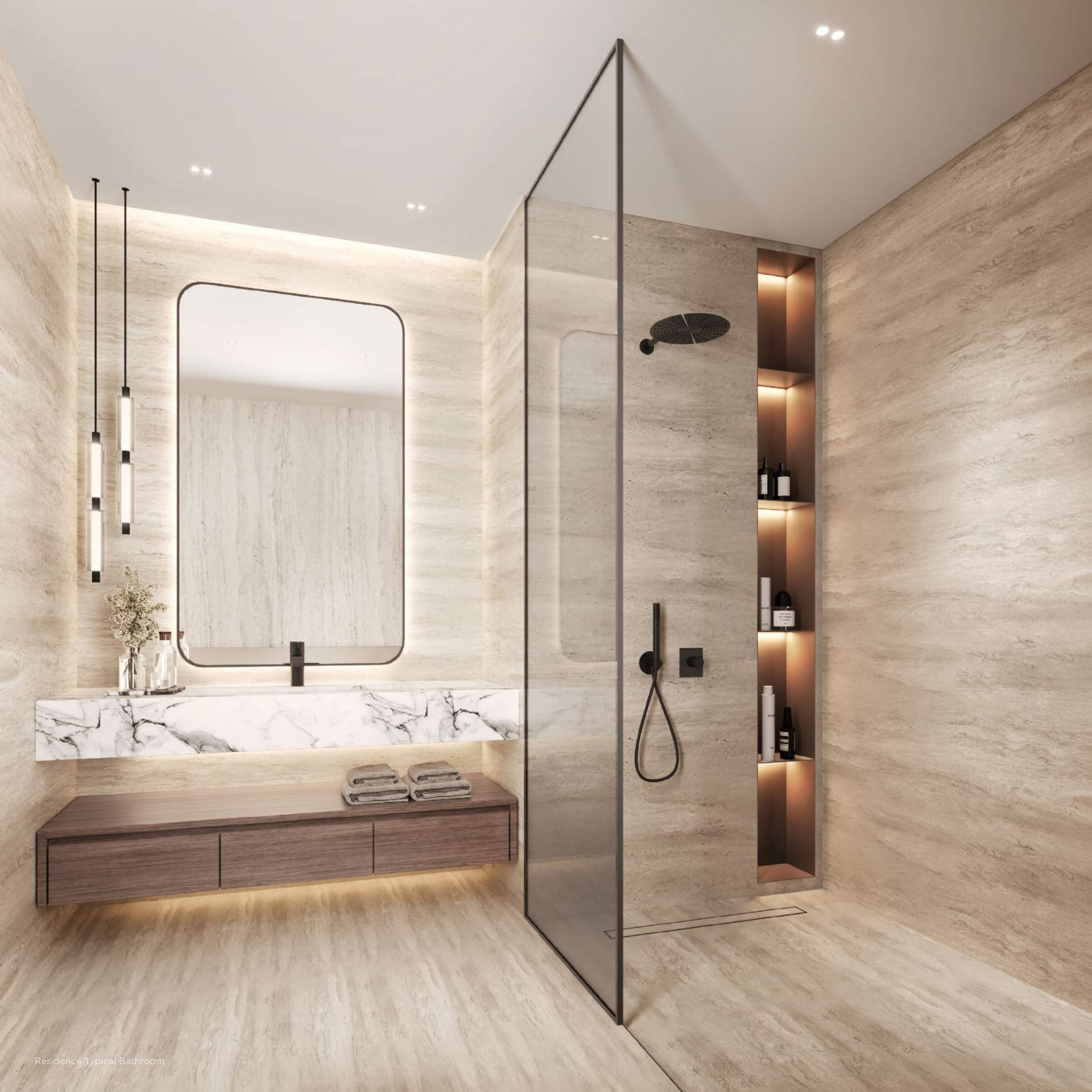
Residence Typical Bathroom